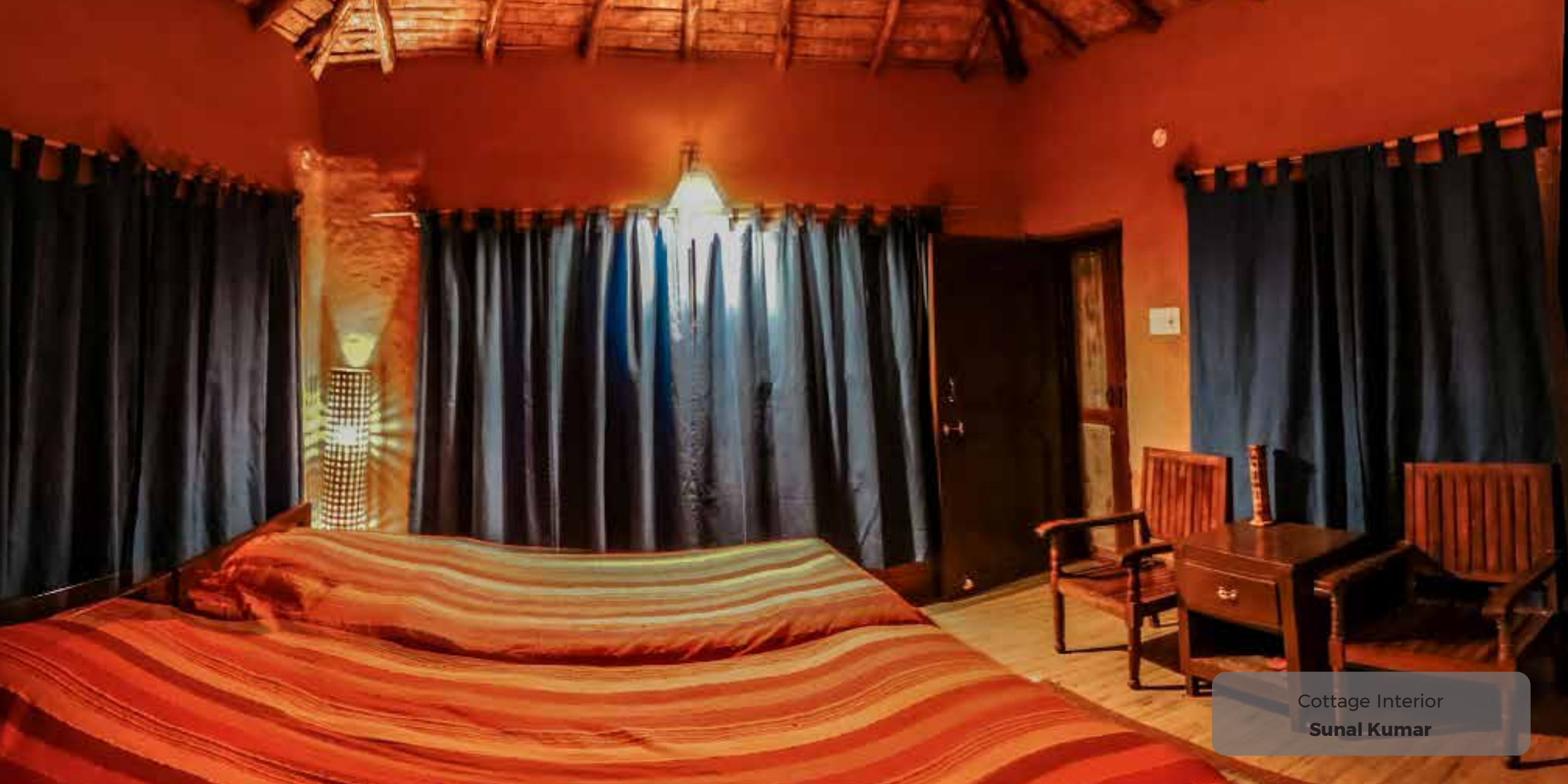
Cottage Interior Sunal Kumar