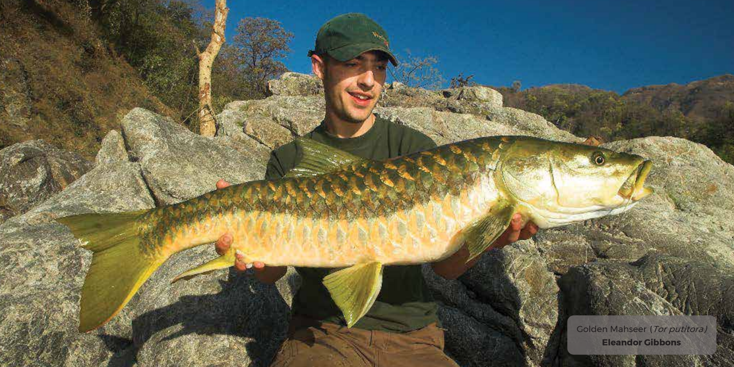
Golden Mahseer ( Tor putitora)